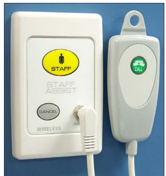
Fig.2 Wireless Call point (with Optional Patient Push Set Socket )

WARNING: In this configuration depletion of battery life will occur if plug is left un-installed.